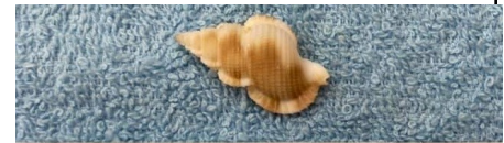
Halgyrineum louisae (Lewis, 1974) Norfolk Ridge, New Caledonia dredged at 400 meters